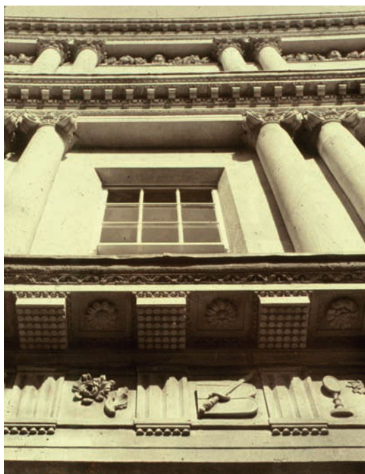
Figure 2.3 After repairs to 14 Circus during 1973/74.