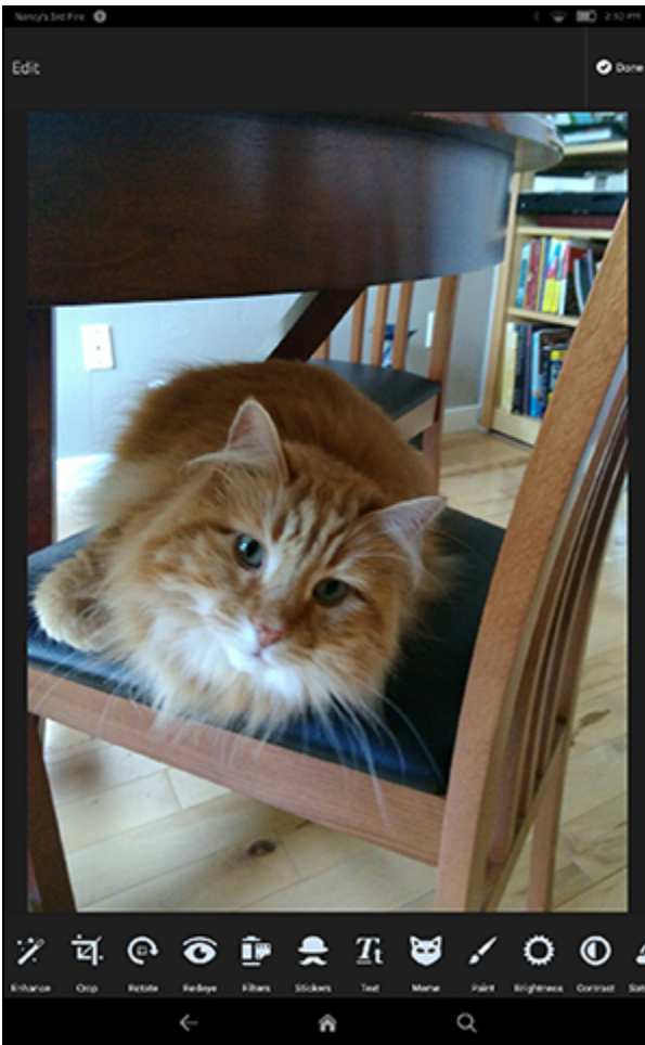
Figure 1-2: Use the Photos app to view photos and edit them.