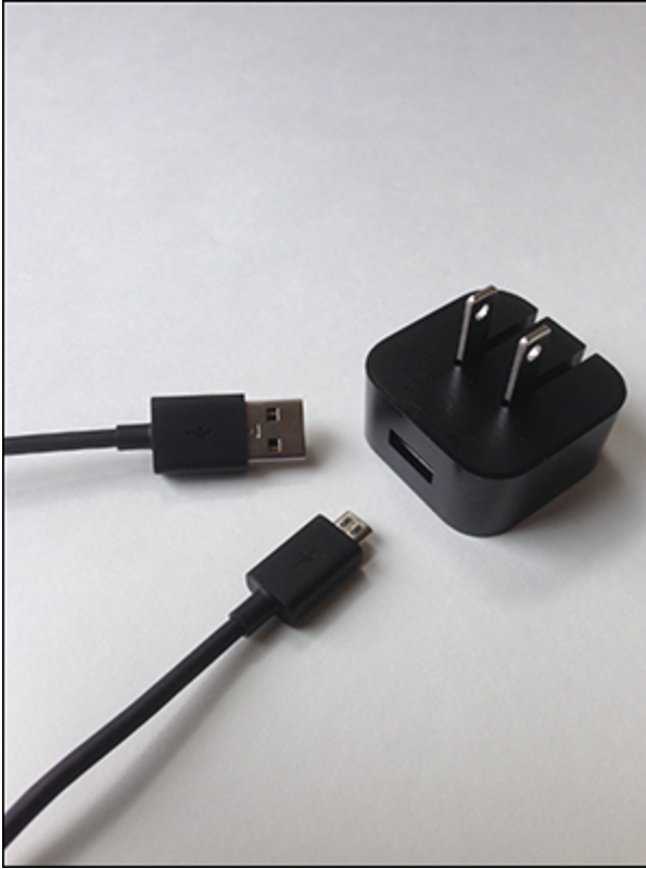
Figure 1-3: The Fire's micro USB cable and a power adapter.