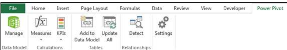
Figure 2-1: When the add-in has been activated, you see a new Power Pivot tab on the Ribbon.

After installing the add-in, you should see the Power Pivot tab on the Excel Ribbon, as shown in Figure 2-1 .