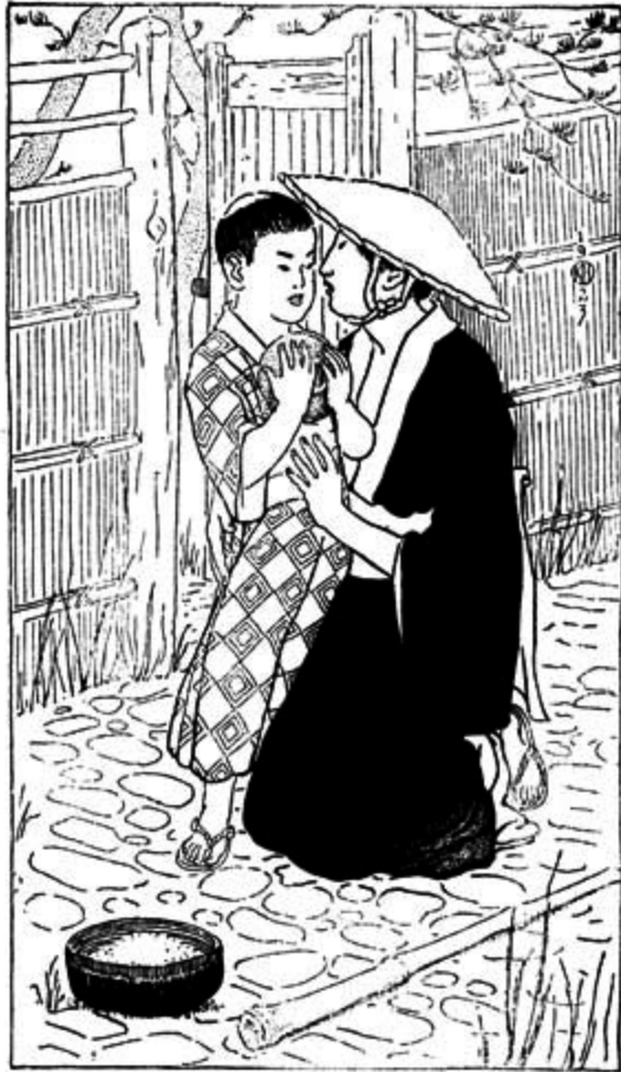
The Evergreen Series