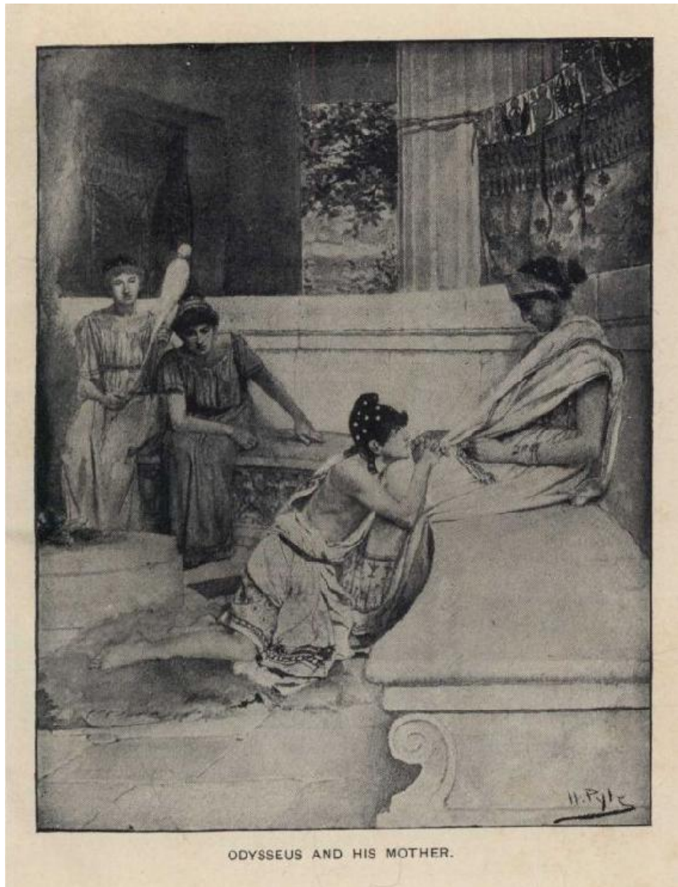
ODYSSEUS AND HIS MOTHER.

The queen's eyes filled with tears as she answered, "You shall have your wish, my son. The promise given both to you and to my father must be fulfilled. For, when you were but a little babe, Autolycus came to Ithaca. And one evening, as he feasted at your father's table, your nurse, Dame