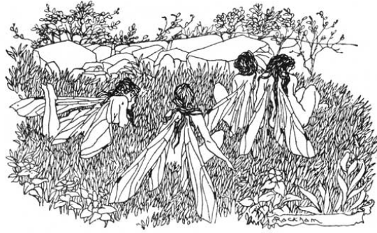
A MIDSUMMER NIGHT'S DREAM